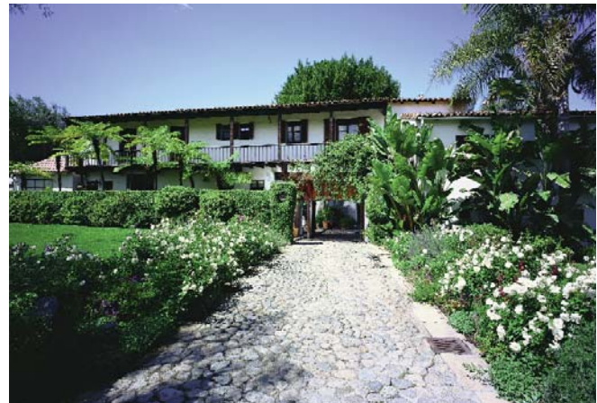
Street view of the Eva Katharine Fudger House.